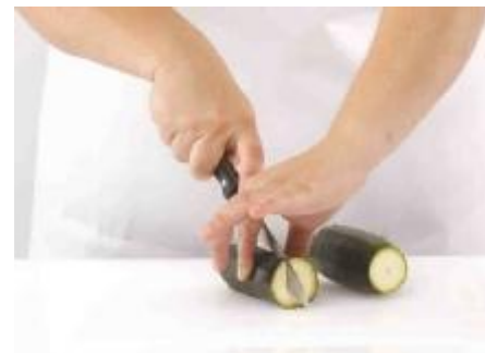
Cutting using the bridge technique