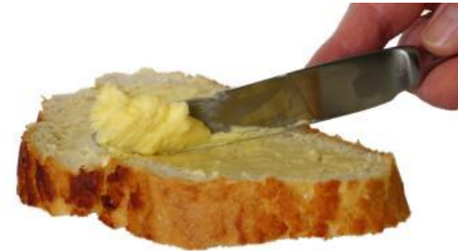
Spreading butter on bread