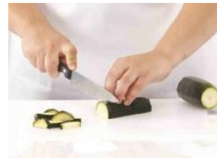
Cutting using the claw technique