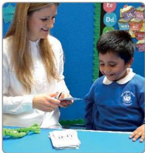
Learning the Speed Sounds in the classroom.